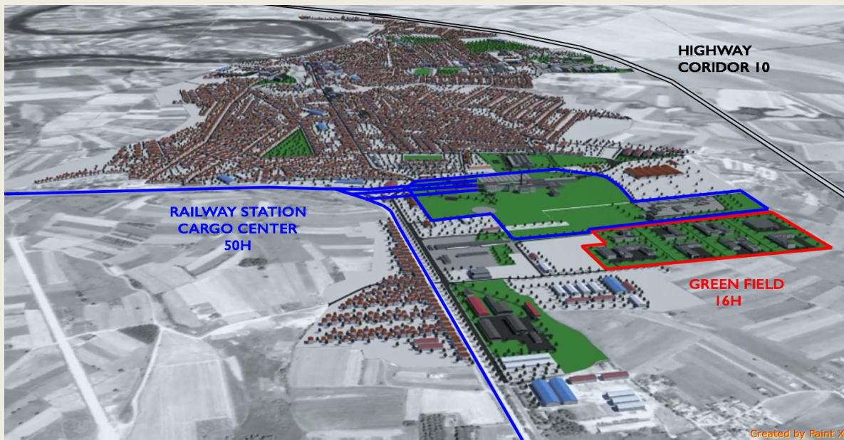
Industrial zone Minel